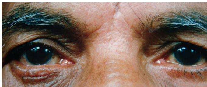
[Table/Fig-4]: Post operative photograph of the case with Senile Entropion right lower lid