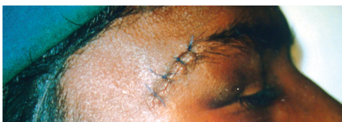
[Table/Fig-8]: Post operative photograph

The Kuhnt-Szymanowski Procedure: It is used for severe ectropion with a marked excess of the skin. It involves a pentagonal full thickness excision of the lid laterally and the excision of the lateral triangle redundant skin. If appropriate, canthal tendon tightening surgery is also done.