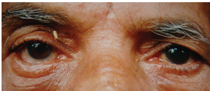
[Table/Fig-3]: Pre-operative photograph with Senile Entropion right lower lid