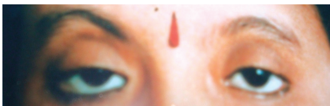
[Table/Fig-5]: Pre-operative photograph Bilateral simple congenital ptosis